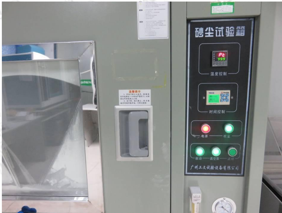
Fig. 4 The Dustproof test