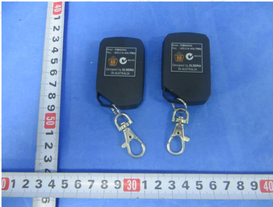
Fig. 2 Product Picture