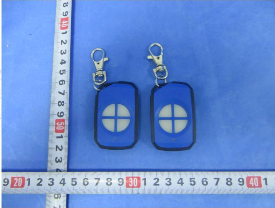
Fig. 1 Product Picture