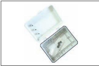
Weatherproof Case for receiver unit