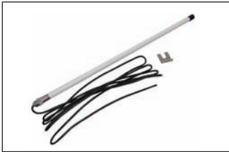
Suitable Antennas ANT27 series (27MHz Series) or ANT433 series (433MHz Series)