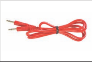
Gigalink™ Coding Cable For coding Gigalink transmitters to receivers