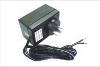
Suitable Power packs 12PP-1000 , 12V DC 1000mA 24PP , 24V DC 500mA.