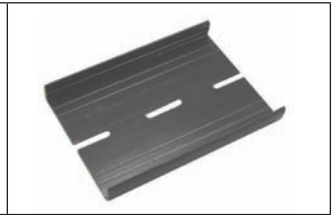
QM150 Quick Mount for easy mounting of receivers on walls.